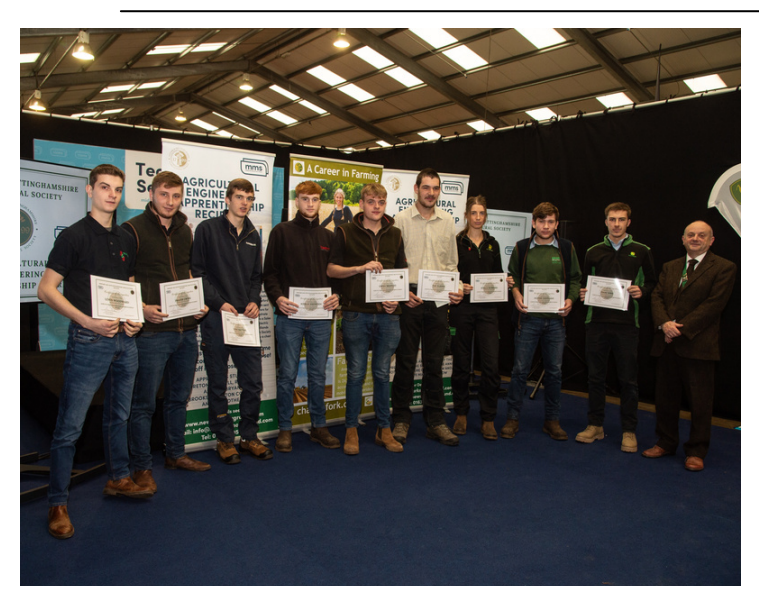
Midlands Machinery Show continuing to back the next generation of agricultural engineers

We are delighted to announce that the Midlands Agricultural Engineering Apprenticeship Awards is returning for its sixth year at the show – 16th and 17th November 2022.