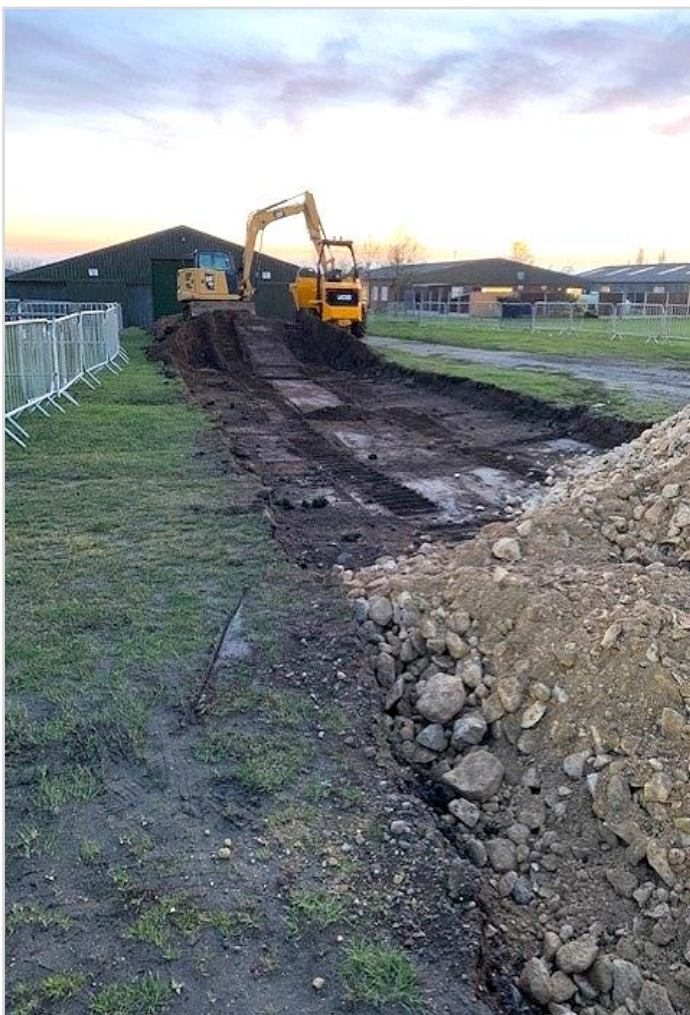
Improvements to Roadway to Facilitate Vaccination Centre