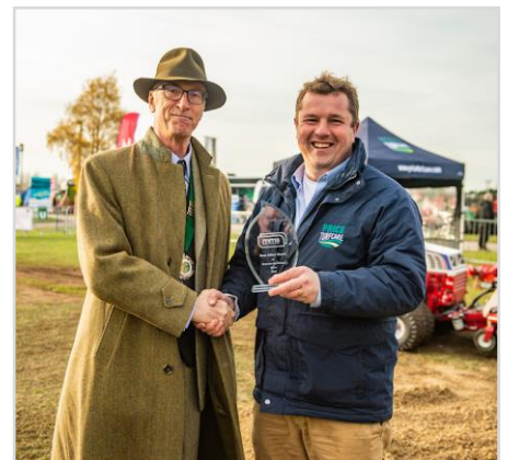
CONFIDENCE IN STAND BOOKINGS FOR MIDLANDS MACHINERY SHOW

The long-awaited Step 4 of England's Roadmap out of Lockdown has seen an immediate and positive uplift at the Showground.